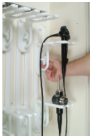
M1295 Holder storing a small scope with a light-source lead.