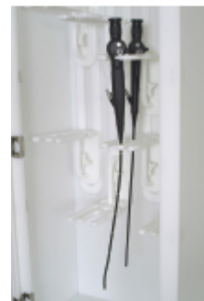
M1295 Holder can hold two small scopes with no light-source leads.